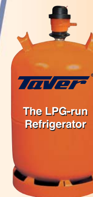
The LPG-run Refrigerator