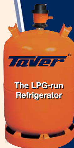
The LPG-run Refrigerator